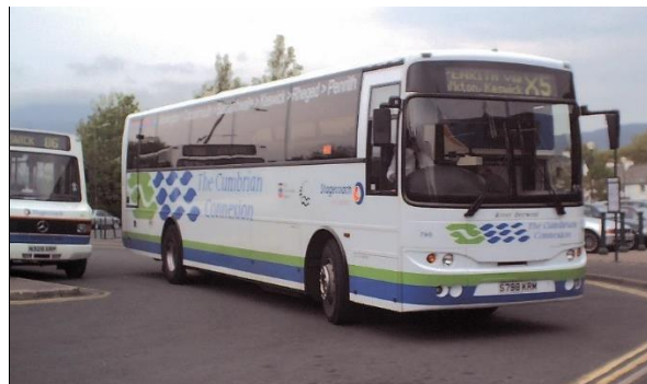
Four Volvo coaches were new in 1998 for the hourly X4/X5 Workington to Penrith service. At one time these carried Cumbria Connexions colours. This is Keswick bus station.