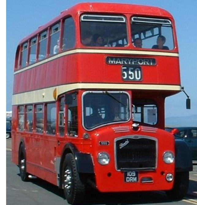
Preserved Bristol Lodekka 109 DRM sits in the sun at Maryport. This bus in traditional CMS colours was built in 1964