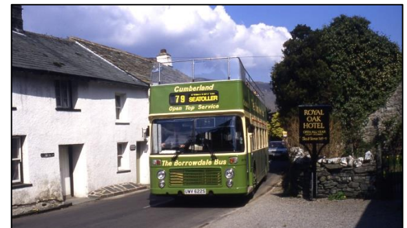
Open topper squeezing through Rosthwaite in Borrowdale