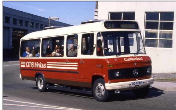
Privatisation in 1986 saw a fleet of Mercedes 608D 23 seat minibuses in service to increase town service frequencies.