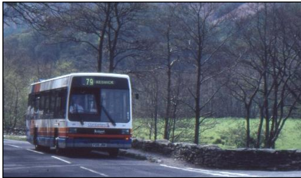
A Workington-built Leyland Lynx in Borrowdale

Welcome to this exhibition to mark 100 years of service in Cumbria by Cumberland Motor Services