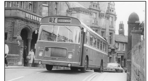
A Bristol RE climbs over Cockermouth's Cocker Bridge