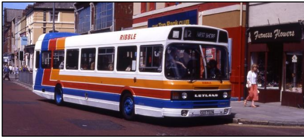
Leyland National Mk2 in Stagecoach stripes in Barrow

Under Stagecoach, there was investment to modernize the fleet and its depots. On 26 th June 1992 the new depot at Lillyhall was opened to replace old facilities in Whitehaven and Workington town centres.