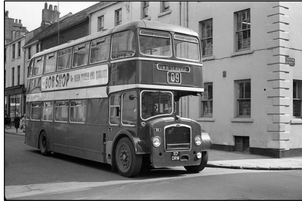
A 70 seat Bristol Lodekka on 1960s Whitehaven town service to Mirehouse. Current service levels are much lower, using buses of around 1/3 the seating capacity!